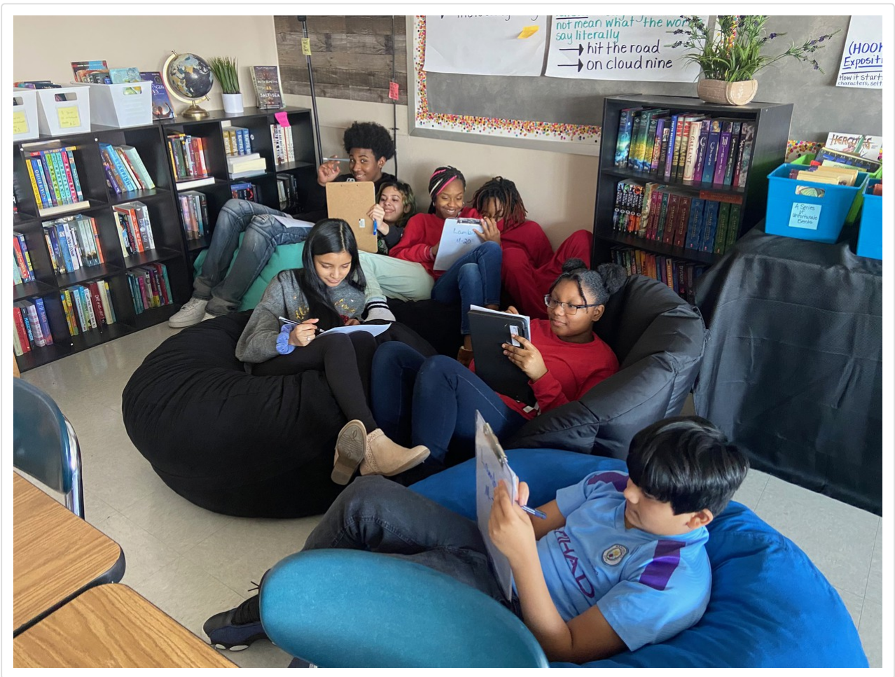
Workforce Wednesday in the High School